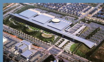
Keihanna Open Innovation Center @ KYOTO

Based on an exemption made for the National Property Law, the gratuitous conveyance of the former "Vocational Museum" from the national government to the Kyoto Prefectural government was made possible, laying the groundwork needed to prepare the "Keihanna Open Innovation Center @ KYOTO (KICK)." In addition to acting as a space used for research projects performed in collaboration between industry and academic institutions, this center is also used as the venue for such large-scale events as the "Kyoto Smart City Expo," etc., and efforts are being made to establish this center as a hub for global open innovation with a key focus placed on development in the field of smart communities.