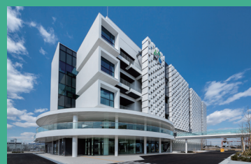
Kobe Center for Medical Innovation

By utilizing the Comprehensive Special Zone Coordination Fund (*), preparations were made to establish the "Kobe Center for Medical Innovation," a new drug development innovation hub located at the KOBE Biomedical Innovation Cluster. With the aim of accelerating research and development of innovative pharmaceuticals and regenerative medicine, etc., this center offers tenant office space and access to cell culturing facilities that can be used for product development for such fields as regenerative medicine for pharmaceutical companies and new drug development startup companies, etc., while at the same time providing a support system to aid in the matching up of tenant companies and in providing assistance to bring potential products to market.